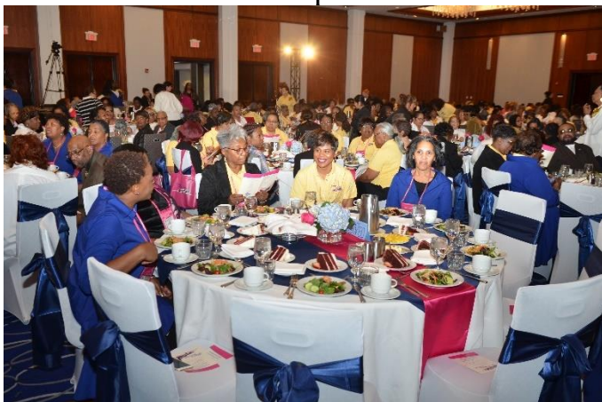
The Young Adult Missionary Luncheon was awesome. The testimonies of the young women were very inspiring. As I listened and absorbed how these young women's

This Learning Experience helped me to realize, though I lost a love one, I can move forward with God's help.