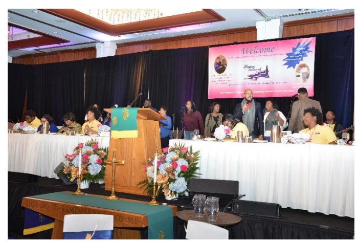
lives had been impacted yet their faith didn't falter. I commend them for sharing something we all need to do so others will know that they are not alone. Thank you for letting us know how we too can put the past behind us and trust God as we move forward.